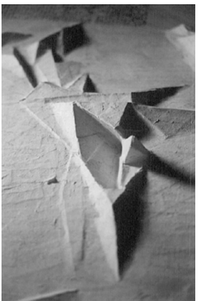
Figure 2.1: Shinkenchiku [Atelier Z, 2002.]

To begin this discussion, you must imagine a line that mediates between the Earth and the Sky. As this is a dimensional situation, the line transforms into a zero-plane, a skin of no thickness that is draped between the undulations of the Earth/Sky, stretching out beyond the quantification of our perceived horizon. It is quintessential to our discussion, that anything which we create is merely seen as a modification of this relationship, and not a purely creative act; similar to the geotectonic forces that from time to time shall swell up and spew stone up towards the heavens; leaving chasms into its belly. We do not create space, we only transform relationships between matter and air for the purposes of our emotive intents.