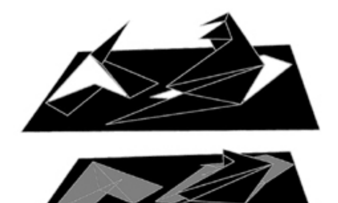
Figure 3.1: duPont / Corian Pavilion [Atelier Z, 1999.]