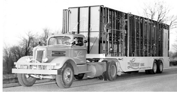
Fig. 5. Lustron Corporation, 1948.

highly unlikely that transportation systems will fully stall as our global economy is co-dependent, but as responsible academics and practitioners, it would be best for us to consider localizing material resources and production. But, from the consumers' perspective, the romance of watching a 1948 Lustron truck leaving the factory loaded with their personal home, and driving directly to their site is timelessly appealing and decadent.