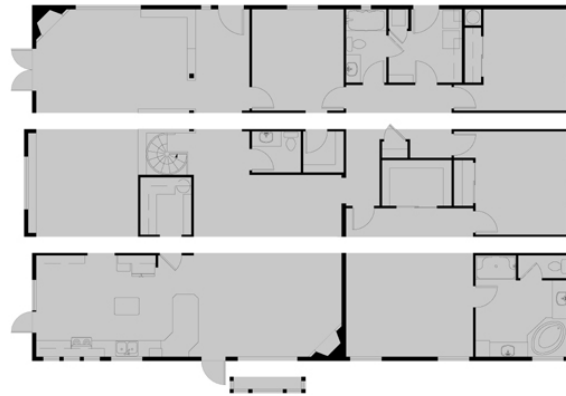
Fig. 1. Atelier Z, Karsten KE-03 modified, 2003.

have become so very profitable with modular construction of multi-family housing, hotels, and plan-booked single family homes. Anything within the standard rectangular volume can be tweaked slightly, but cannot alter any structural paths. Beams have to fit between head clearances and the top of the module. Anything outside of the rectangle is a site-built feature at the owner's additional expense, such as site work, bay windows, dormers, etc.