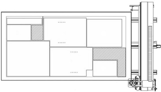
Fig. 2. Nested Parts for CNC Cutting from Sheet Stock

Over the decades, the ability to maximize the number of individual parts from stock lengths / sheets of raw material has created computer numerical control [CNC] manufacturing of parts, layout and cutting practices with improved environmentally sustainable practices. This process is called nesting, as the software puzzles together two and/or three-dimensional pieces within limited constraints. From linear elements, like 2x's for roof trusses, there is an average 10% efficiency, which means less waste and a healthier planet. We may also use this same software to pack elements in a flat or volumetric matrix, much like the game 'Tetris', to 'nest' these multiple elements into the most compact volume for shipping. Ikea is the poster child for this process within popular culture. [3]