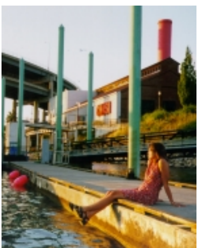
Soaking up the sun at OMSI