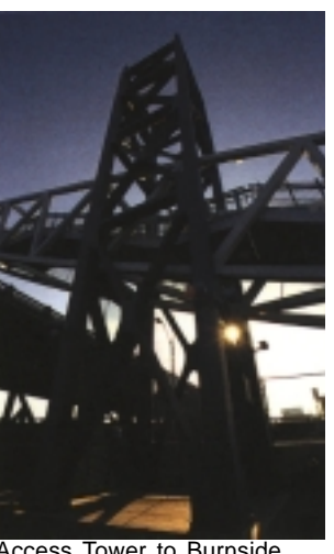
Access Tower to Burnside