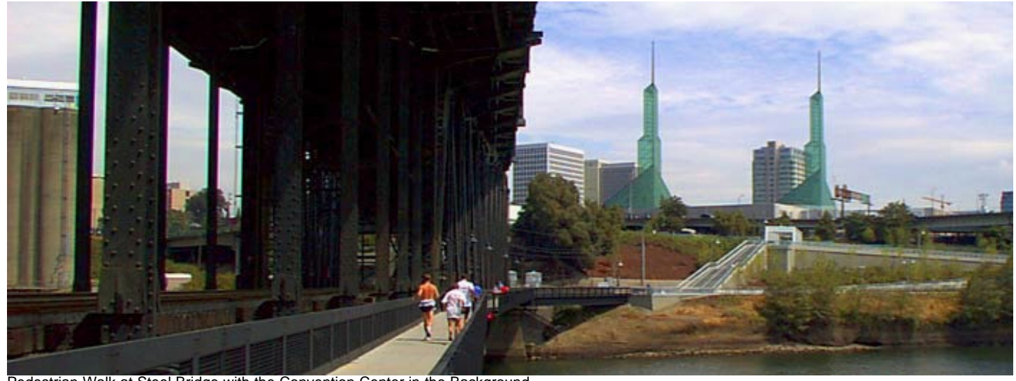
Pedestrian Walk at Steel Bridge with the Convention Center in the Background