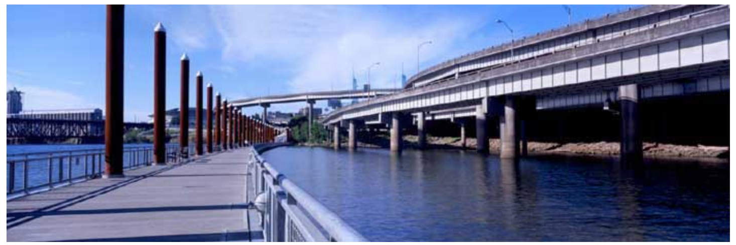
Floating Walkway along Interstate-5