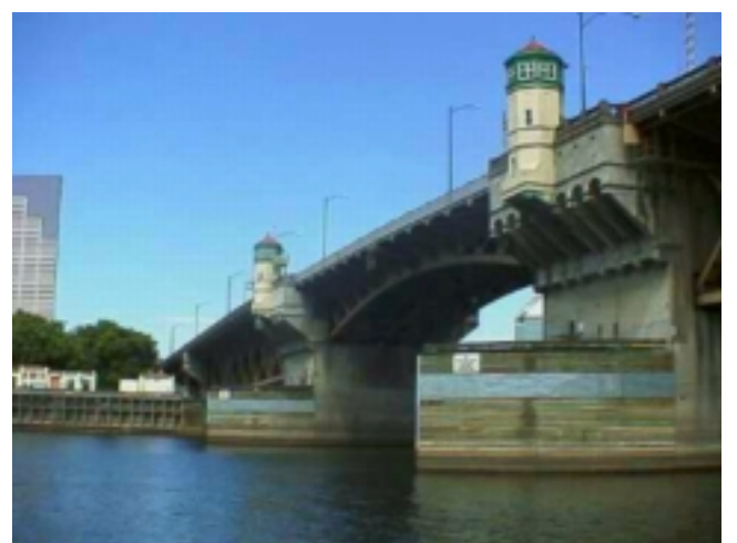
View of Burnside Bridge from Walkway