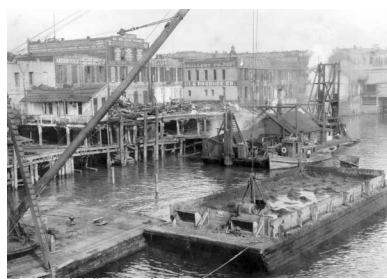
Typical View of Banks, 1928

<a href="http://www.parks.ci.portland.or.us/Eastbank/">http://www.parks.ci.portland.or.us/Eastbank/</a> esplanade.htm>