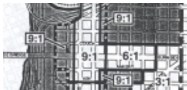
Floor Area Ratios

As the city's population and traffic have increased, Burnside has continued to play an important role in the city's transportation network. Increased interest in several of the districts and neighborhoods adjoining Burnside has raised issues about Burnside and its role. Plans and redevelopment projects in Old Town/Chinatown, the West End, Lower East Burnside Redevelopment, the Civic Stadium and Goose Hollow Area, NW 23rd, the Pearl District and the Brewery Blocks all impact the uses and needs for Burnside, and paint their own picture about the street's future.