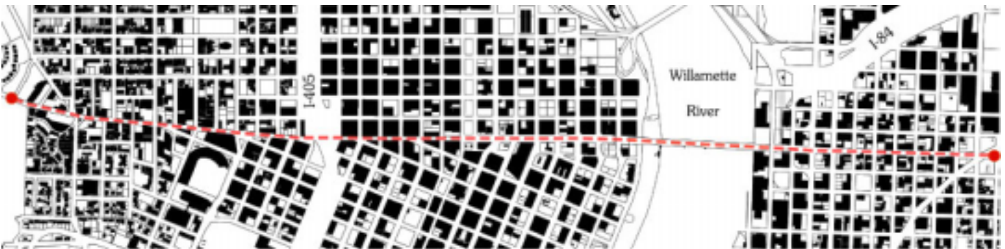
Burnside Plan Area

The Portland Office of Transportation shall be hosting an open house / workshop on 21 March 2002 to review alternatives for the Transportation and Urban Design Plan of Burnside and Options for East 12th and Sandy. This is not officially connected, but relative to the reality of this project's scope. Presentation shall be @ Scottish Rite Center, 1512 SW Morrison Street, Dining Room: 7PM. < http://www.burnsideplan.org >